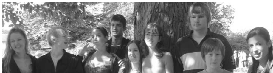
YAG members at the Swanwick Conference

A copy of the full audited accounts can be requested from the Association.