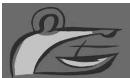
At Your Word, Lord