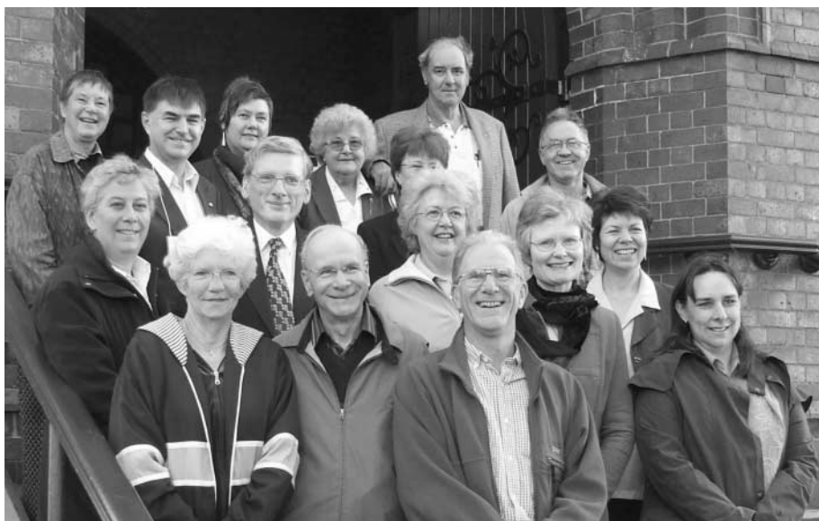
International Conference participants at Newcastle Metropolitan Cathedral

unity “by receiving the Eucharist whenever they attend Mass together”. Delegates were moved to hear a Uniting Church minister, wife of a Catholic, speak of her welcome by the Roman Catholic parish priest and community to receive communion on a continuing basis. Interchurch couples at the conference much appreciated the pastoral sensitivity expressed in these guidelines.