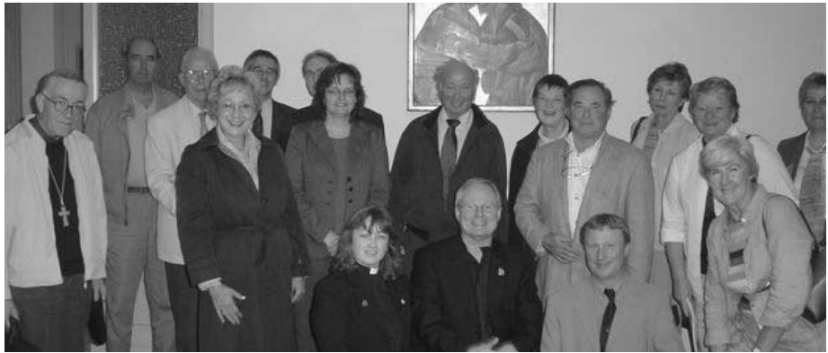
Interchurch family members at the Vatican meeting